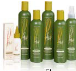
Flyer compliments of Feeling Good Every Day (626) 449-6730